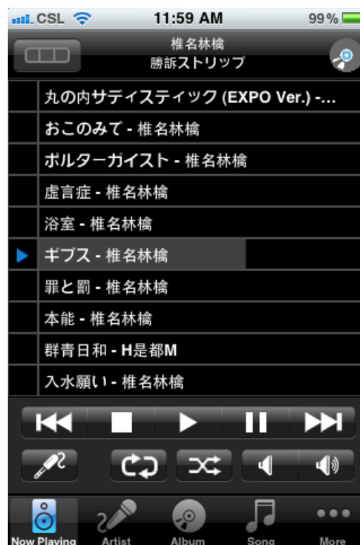
MPod connects to Voyage MPD